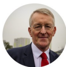
Hilary Benn MP