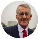
Hilary Benn MP